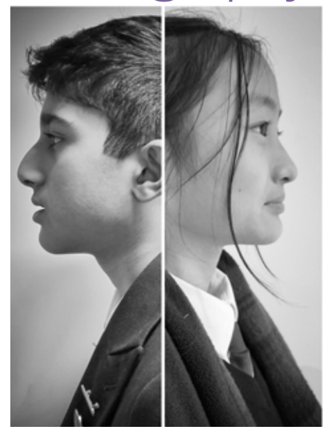
The Prep School Photography Club has been experimenting with eyes and portraiture.